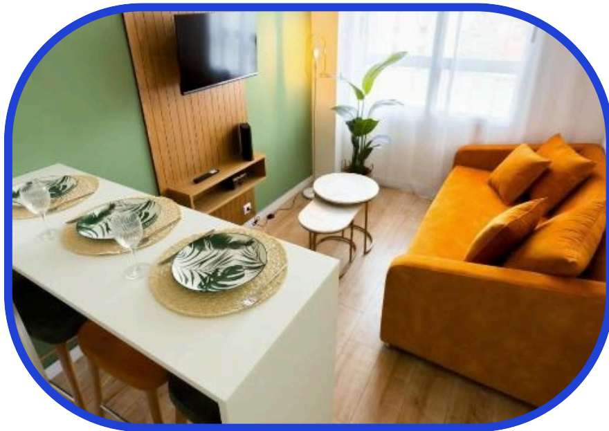
Short-term rental management