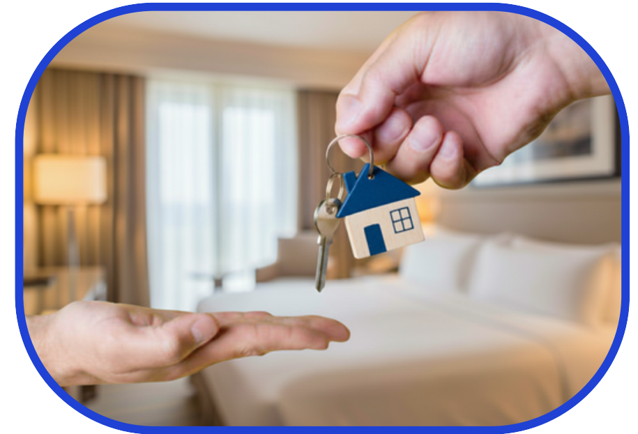
Real estate investment consulting