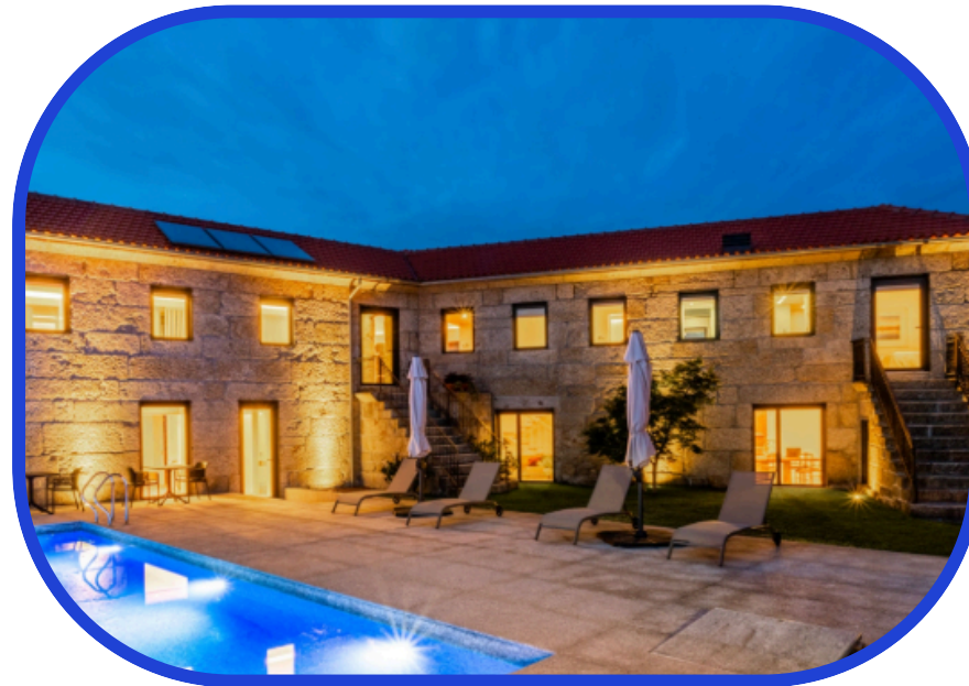
luxury villa management